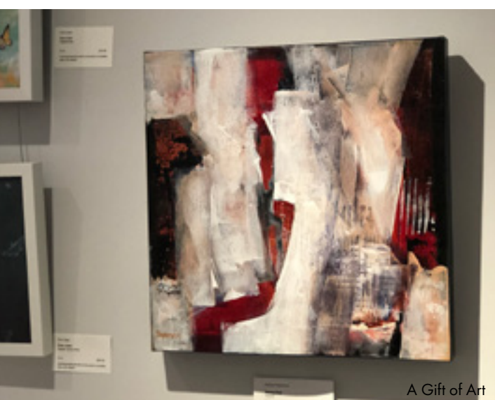
A Gift of Art