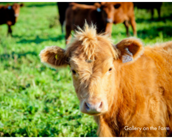
Gallery on the Farm