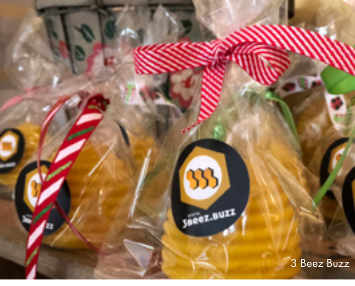
3 Beez Buzz

Discover a mix of rural charm and urban comforts as you explore Clarington's historic downtowns or venture out for a country drive to our rural hamlets. Conveniently located an hour east of Toronto, Clarington is a great getaway.