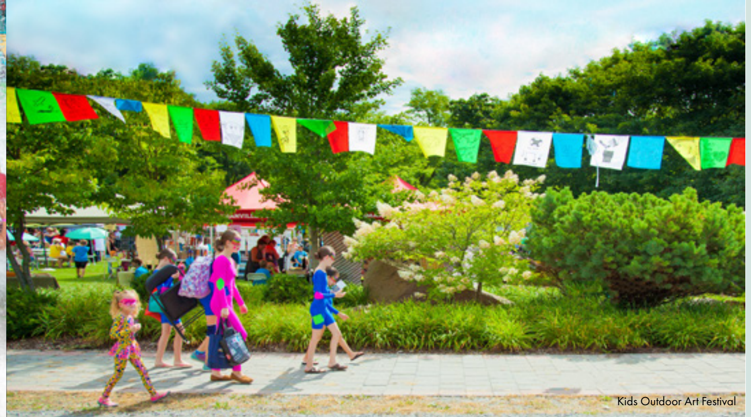
Kids Outdoor Art Festival